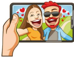
A Parent's Guide to Sharing Pictures