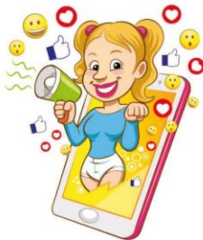
A Parent's Guide to Online Influencers