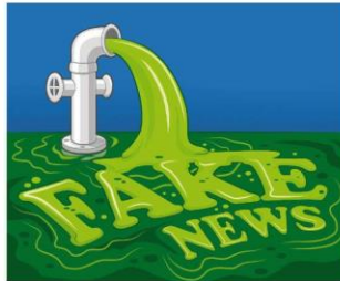
A Parent's Guide to Fake News