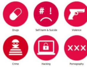
A Parent's Guide to Privacy Settings