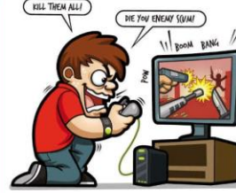
A Parent's Guide to Gaming