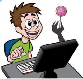
A Parent's Guide to Online Grooming